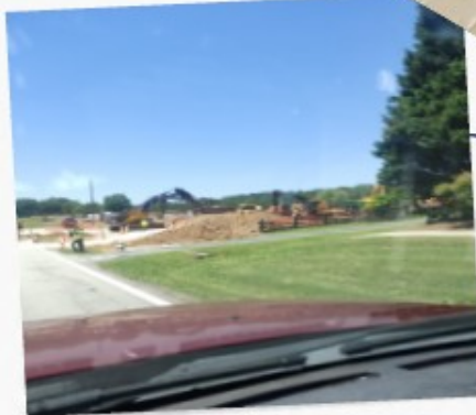
Old roads. New neighborhoods. Same zip code.

Heavy clouds kept showing up even on days that never quite committed to rain. The kind that make you glance upward twice before deciding whether it's worth carrying an umbrella.